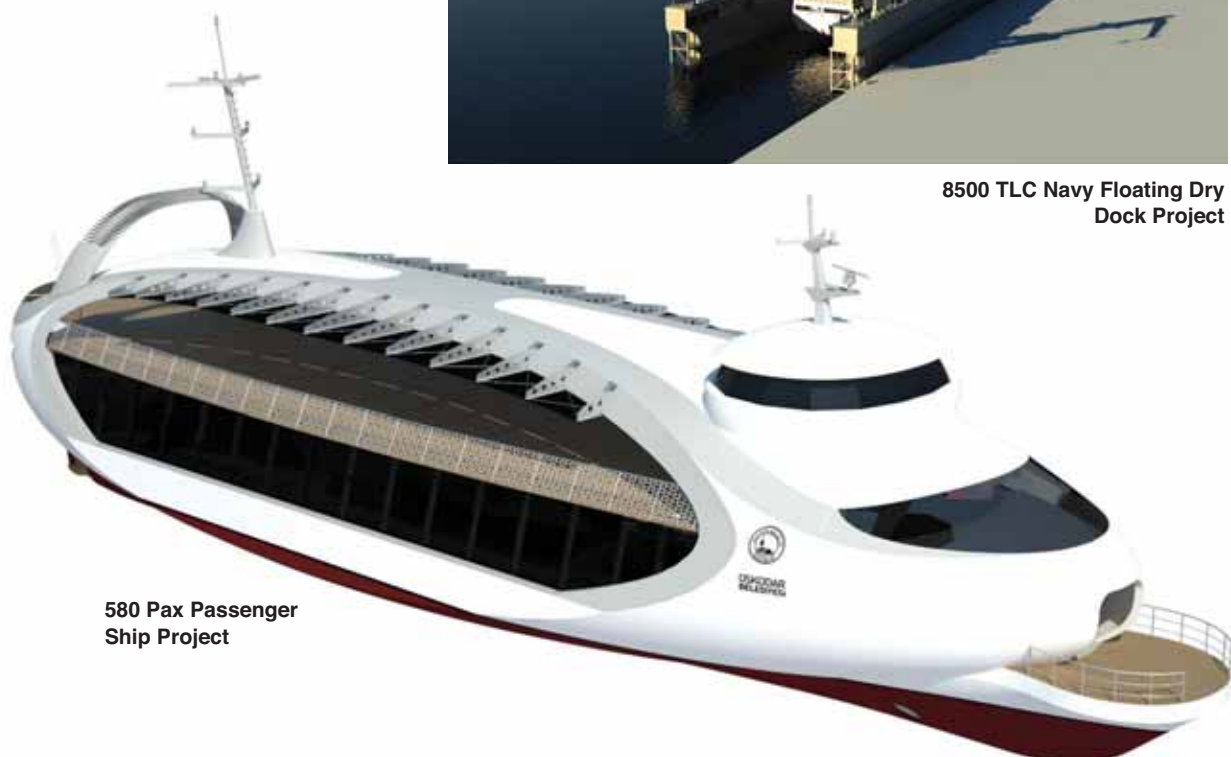
580 Pax Passenger Ship Project