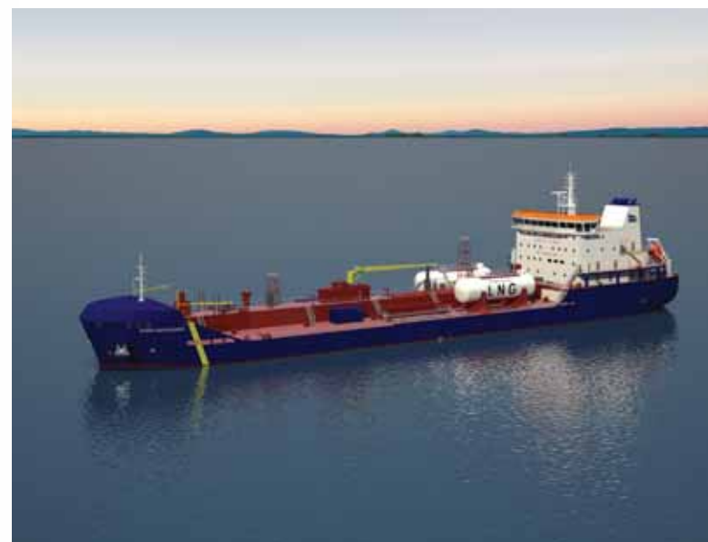
15100 DWT Polar Class Asphalt Tanker Project