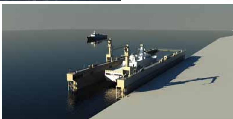
8500 TLC Navy Floating Dry Dock Project