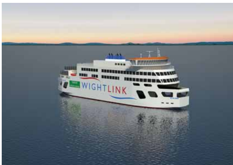
90 m RoPax Project

spective has favored forming a multi-disciplinary team bringing added value into each phase of the ship design process. Such a strong, focused and efficient team is established by blending the experience with dynamism to embrace different perspectives on the way to reach professional perfection. Following the client-focused design development approach and benefiting from the organizational memory have been the key elements for successful projects presenting economical, safe, comfortable, aesthetic and environment-friendly products to merchant and naval maritime. Today Delta Marine is proud to present a big fleet sailing in different parts of the World's seas.