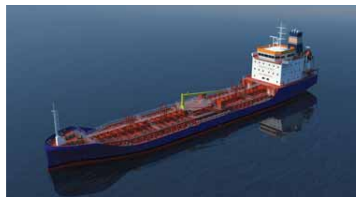
7000 DWT Stainless Steel Tanker Project